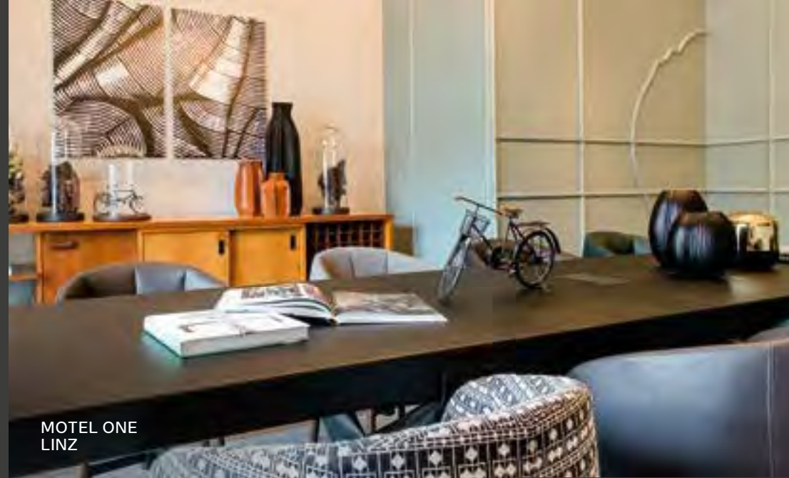
MOTEL ONE LINZ