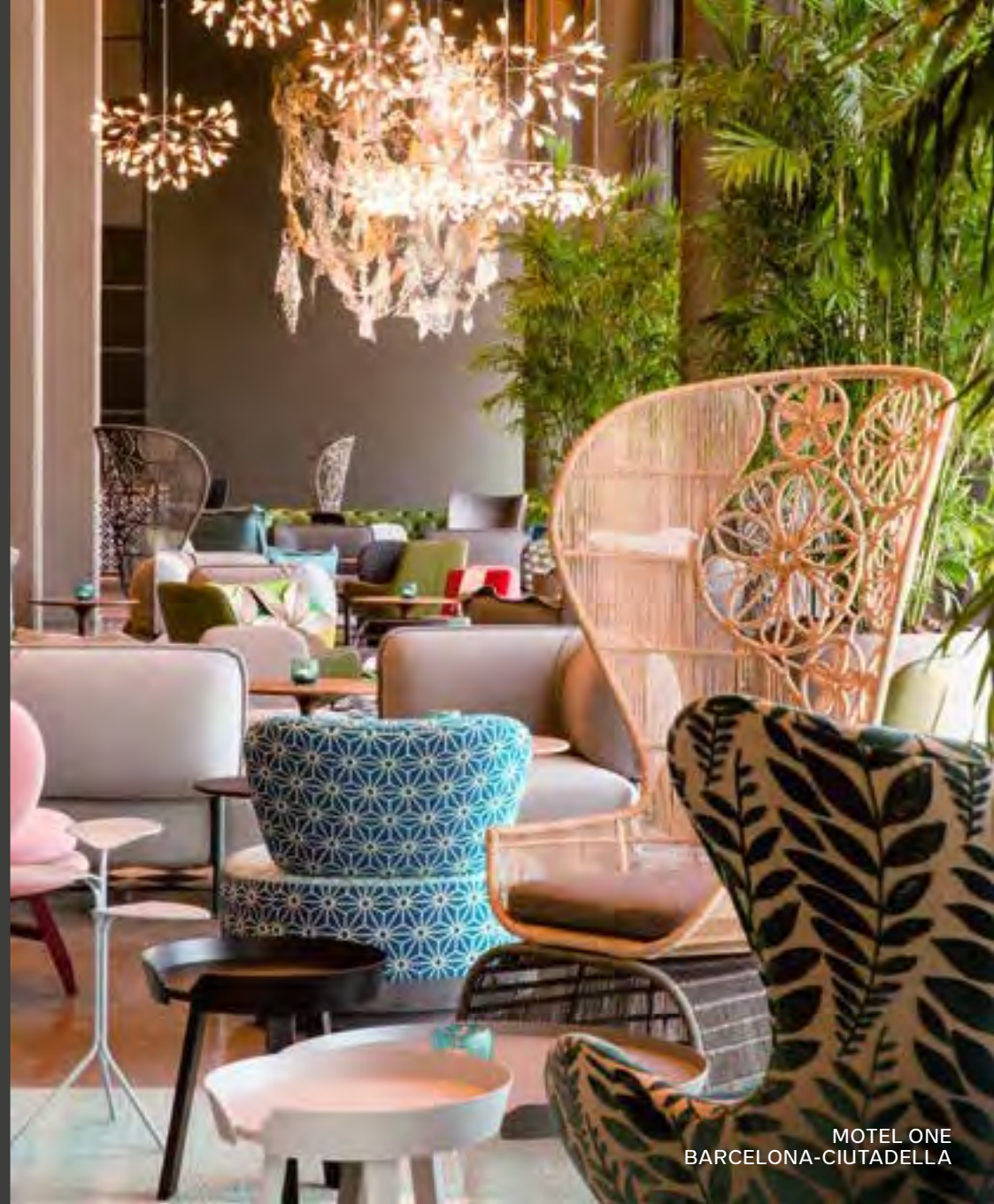
MOTEL ONE BARCELONA-CIUTADELLA