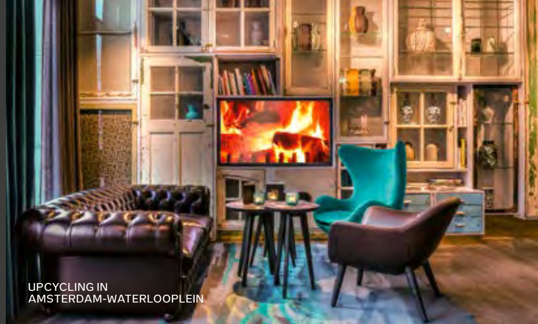
UPCYCLING IN AMSTERDAM-WATERLOOPLEIN