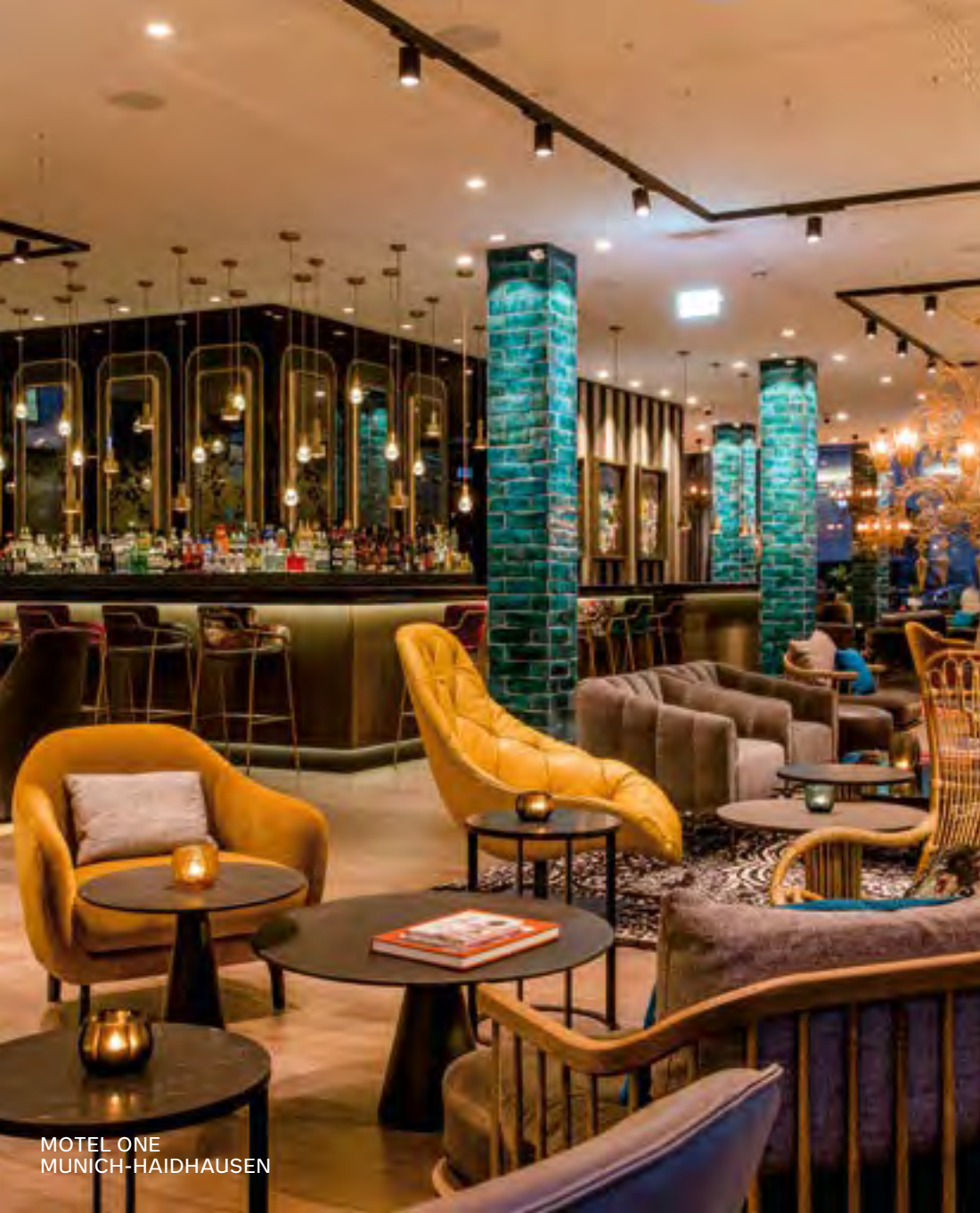
MOTEL ONE MUNICH-HAIDHAUSEN