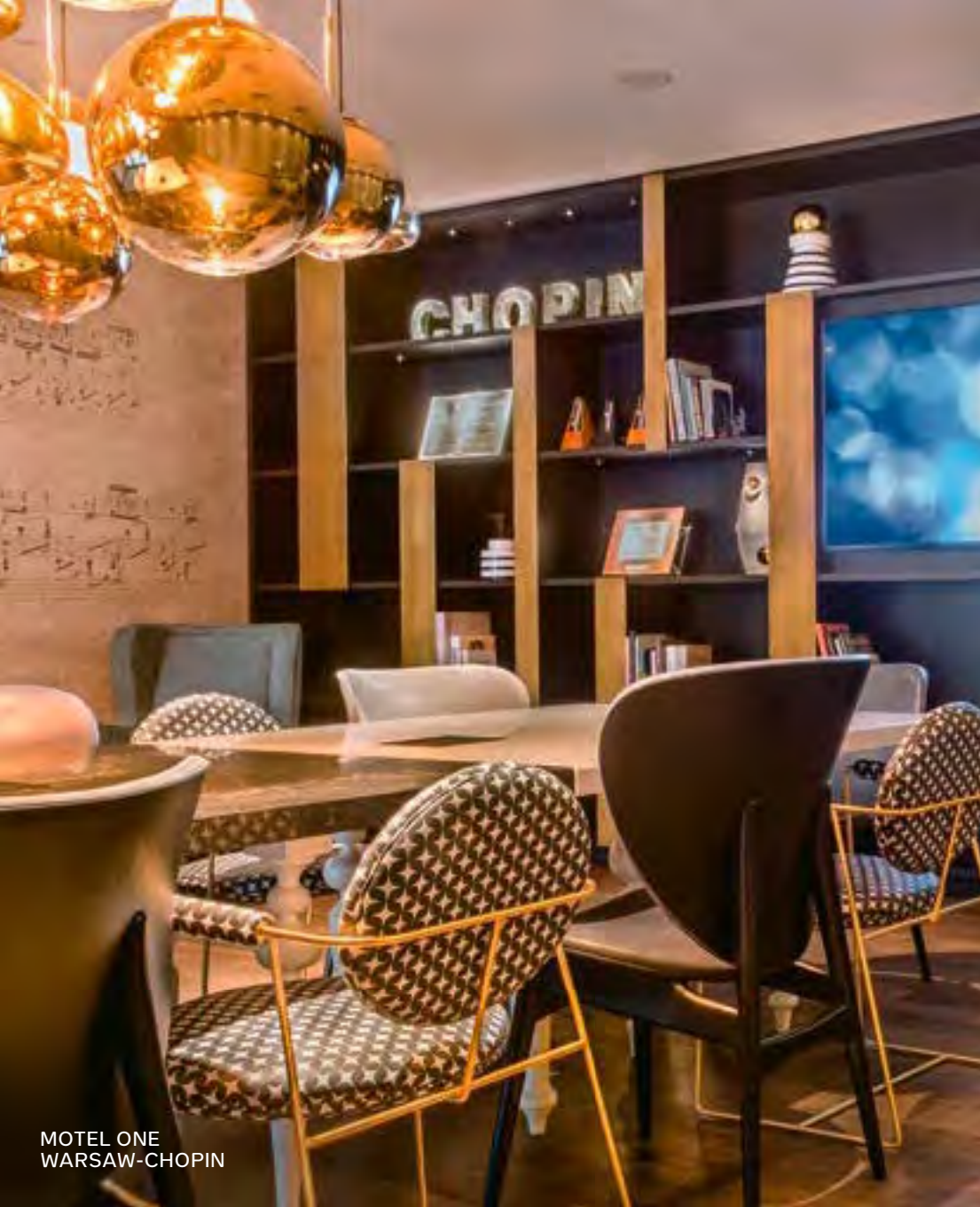
MOTEL ONE WARSAW-CHOPIN