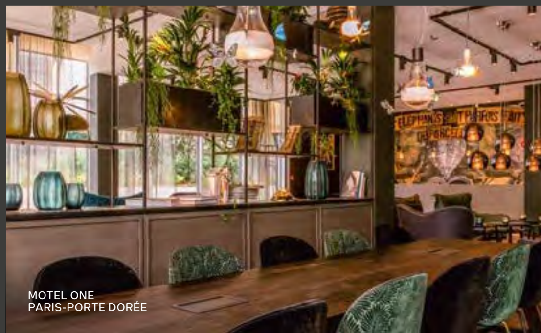
MOTEL ONE PARIS-PORTE DORÉE