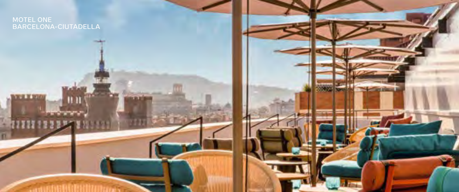
MOTEL ONE BARCELONA-CIUTADELLA