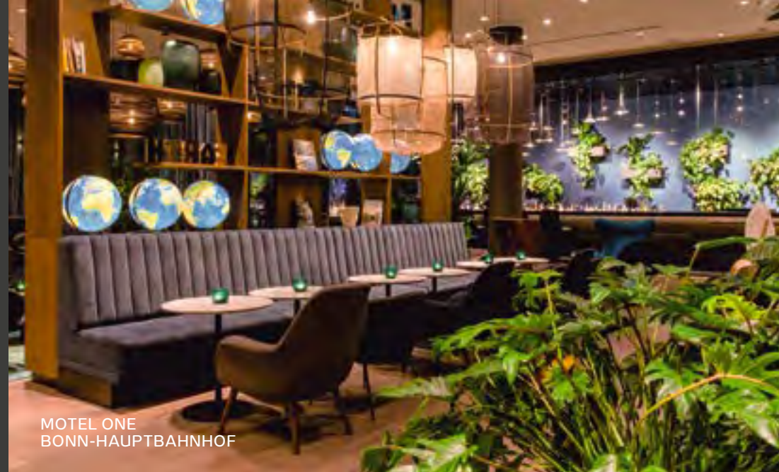
MOTEL ONE BONN-HAUPTBAHNHOF