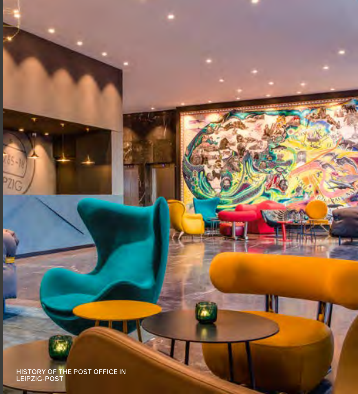
HISTORY OF THE POST OFFICE IN LEIPZIG-POST

We like each hotel to be different. Our hotels each have a unique design and feature different furniture. We care about the local environment and work with local artists and craftsmen to engage with the "neighbourhood story".