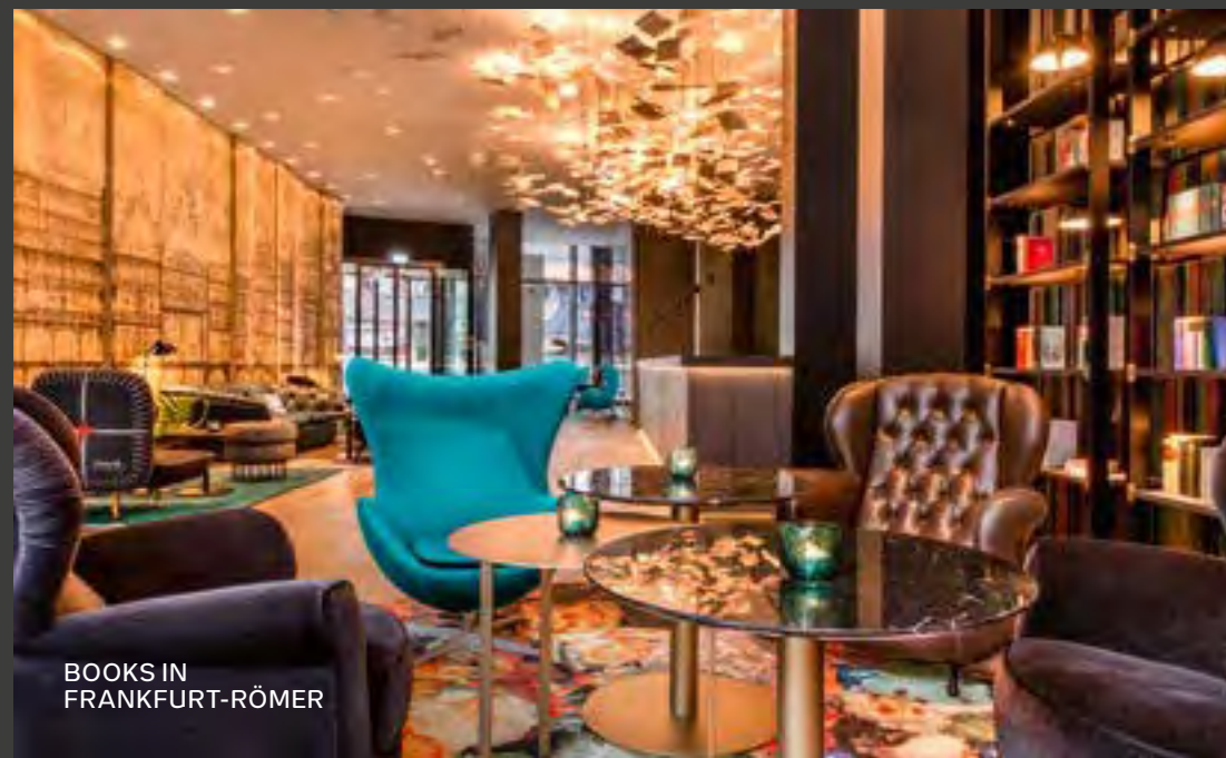
BOOKS IN FRANKFURT-RÖMER