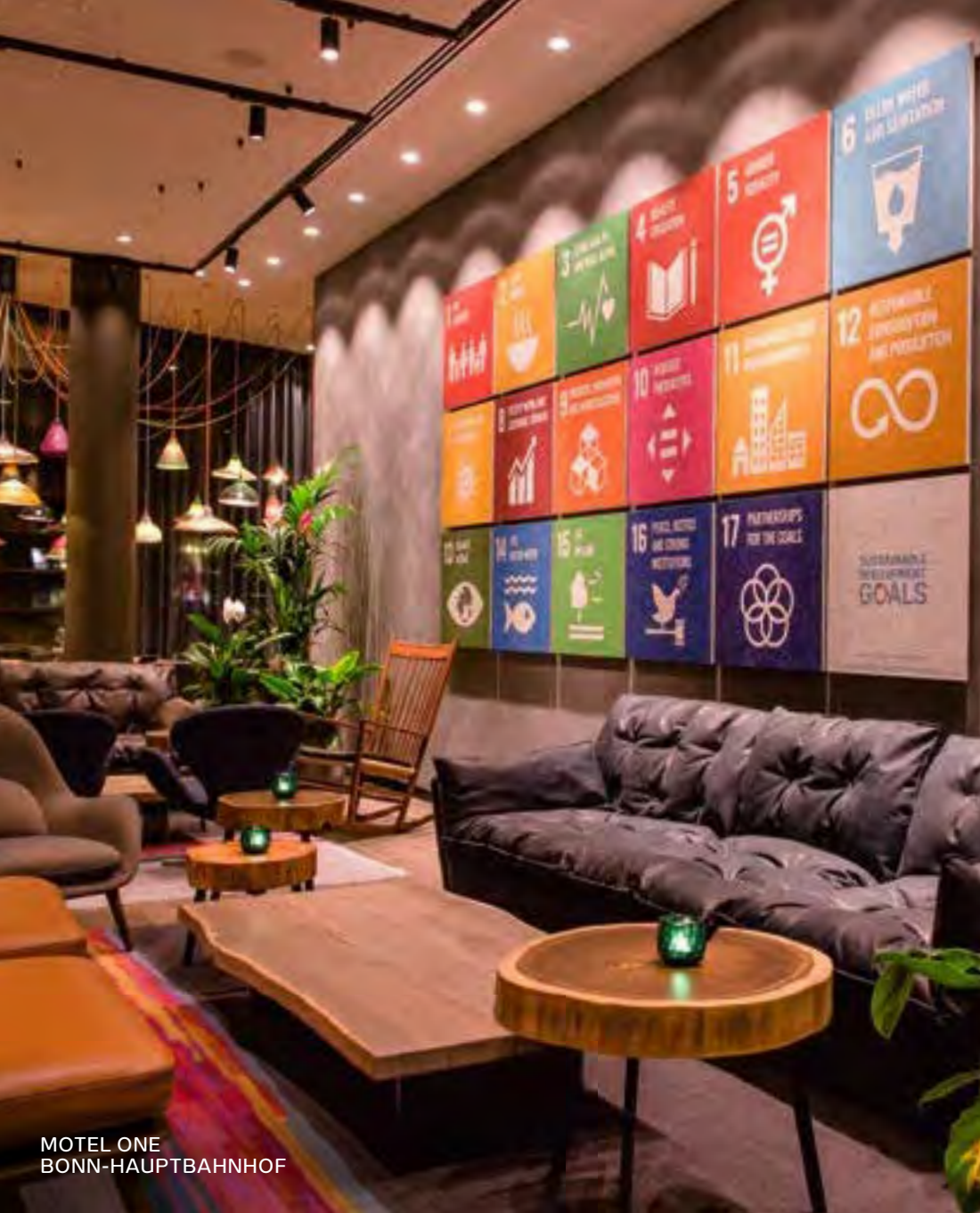
MOTEL ONE BONN-HAUPTBAHNHOF