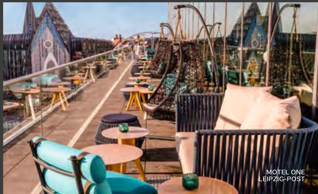
MOTEL ONE LEIPZIG-POST