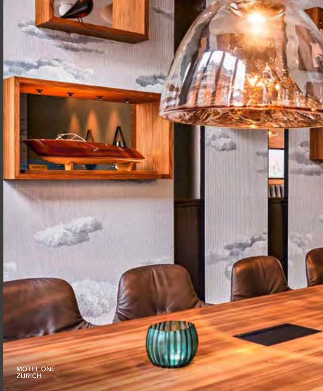
MOTEL ONE ZURICH

With 24/7 coffee, free Wi-Fi and designer furniture, our workspaces provide the perfect environment to catch up on your business or be creative. Some of our hotels also have meeting rooms that guests can book for meetings that require more privacy.