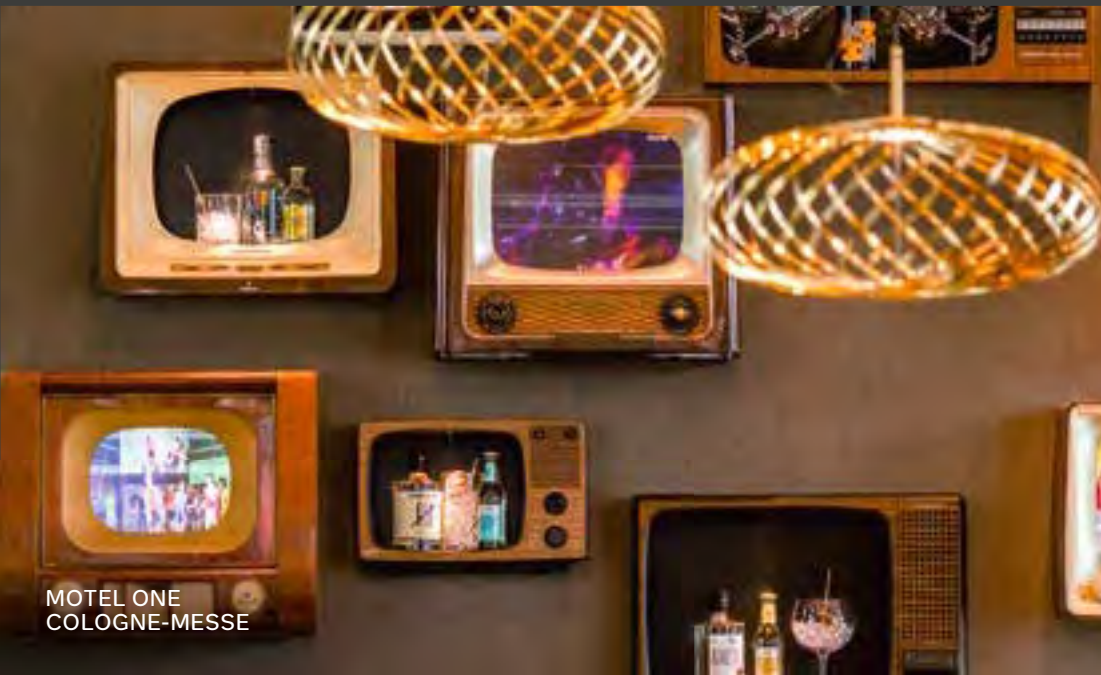
MOTEL ONE COLOGNE-MESSE