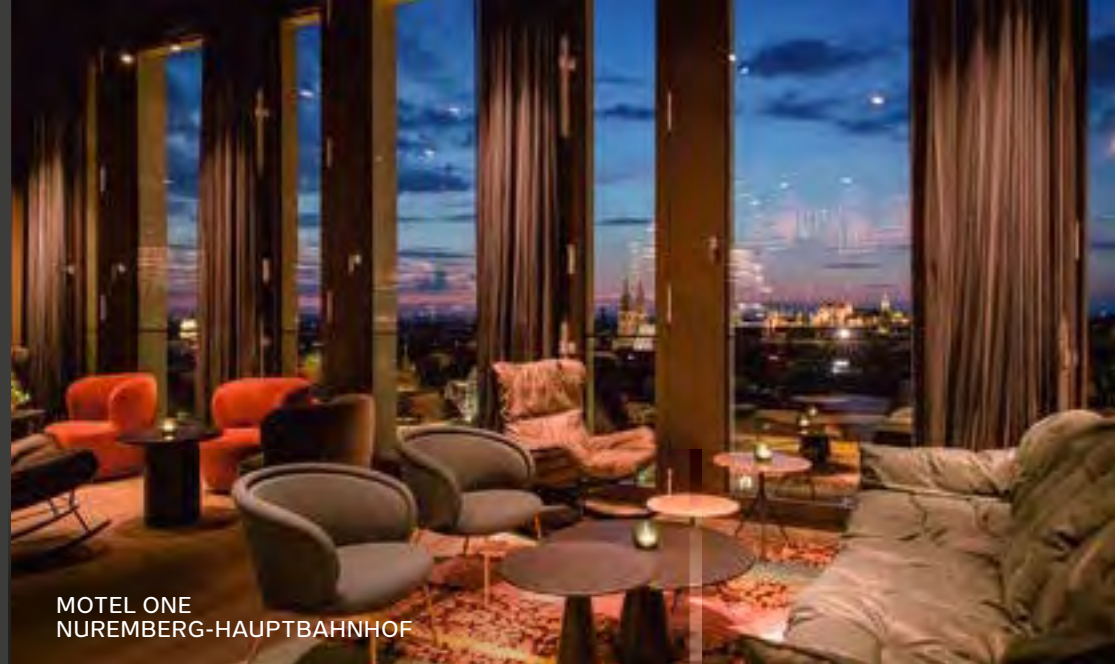
MOTEL ONE NUREMBERG-HAUPTBAHNHOF