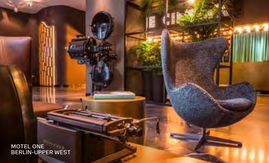
MOTEL ONE BERLIN-UPPER WEST

Our dedication to the highest quality and service is visible in our stylish bars, open to everybody around the clock. Guests can choose from a wide range of high-quality spirits, regional selections of wine and beer as well as an exclusive menu with a selection of minimum 40 top gins, carefully hand-picked with a focus on regional distilleries.