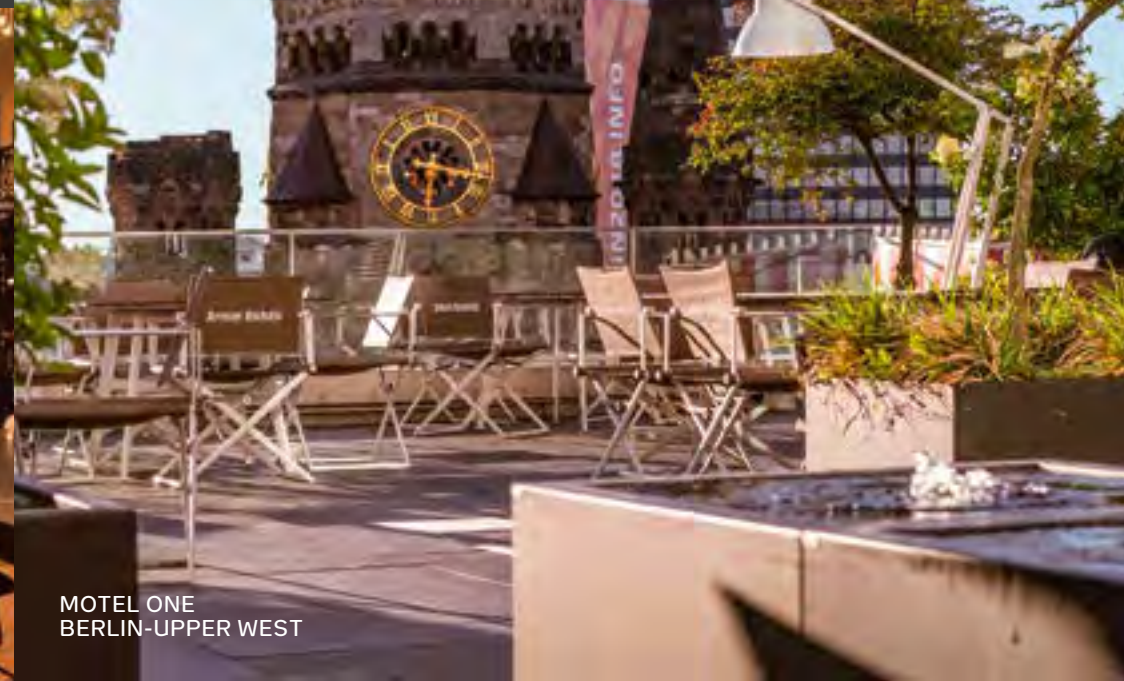
MOTEL ONE BERLIN-UPPER WEST