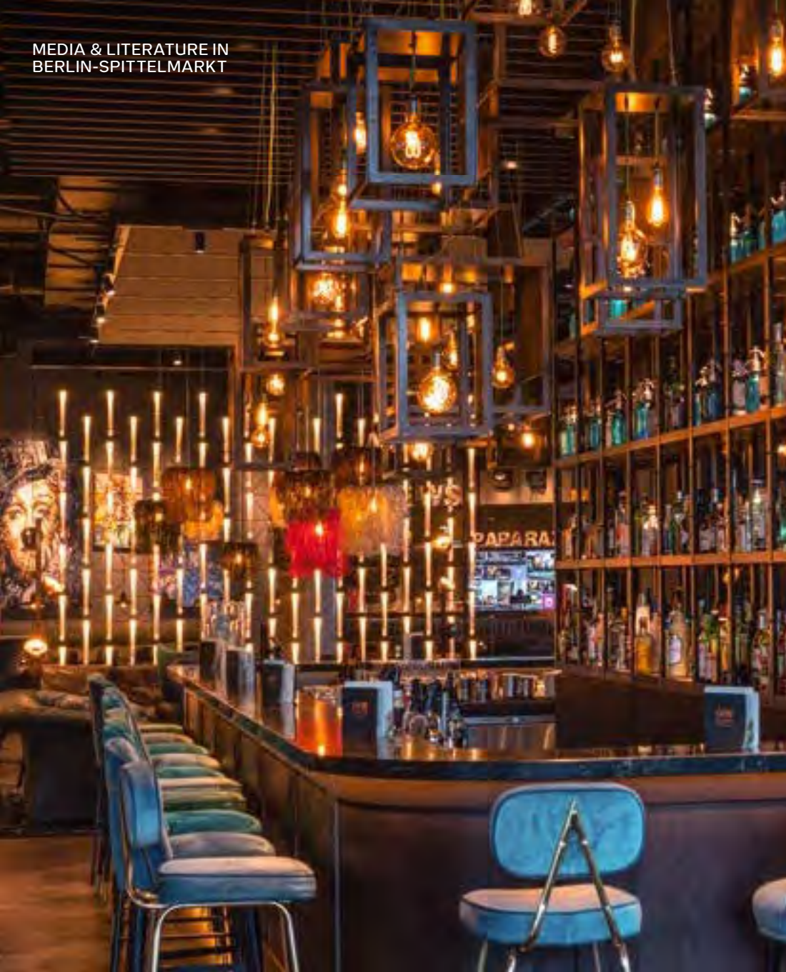
MEDIA & LITERATURE IN BERLIN-SPITTELMARKT